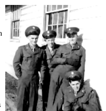
Before landing in Korea